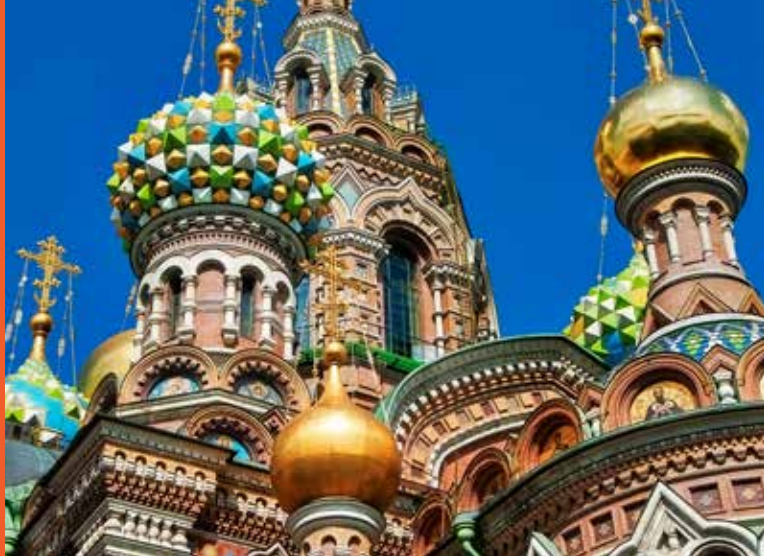
St. Petersburg, Russia